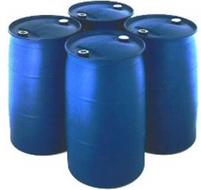
Available in 5 gallon pails and 55 gallon drums

CP Adhesives Contact Cement has been formulated for industrial use. Every feature is designed to expedite fast, smooth production. The high adhesive solids formulations offer increased value as well as an exceptionally fast drying solvent mixture. It is unique in its combination of high initial bond strength and fast development of maximum ultimate strength. This translates into the ability of the user to proceed with machining soon after bonding.